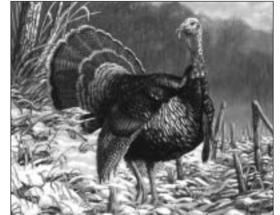
2005 Turkey Stamp art by Terry Doughty